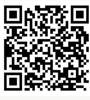
Owners' Committee (Login required) 業主委員會有關資訊 (須登入)

Repaint the base of planters and bench outside Phase 1-3 Shuttle Lift Lobby 為1至3期穿梭電梯大堂外花盤底座及長椅 重新刷油漆